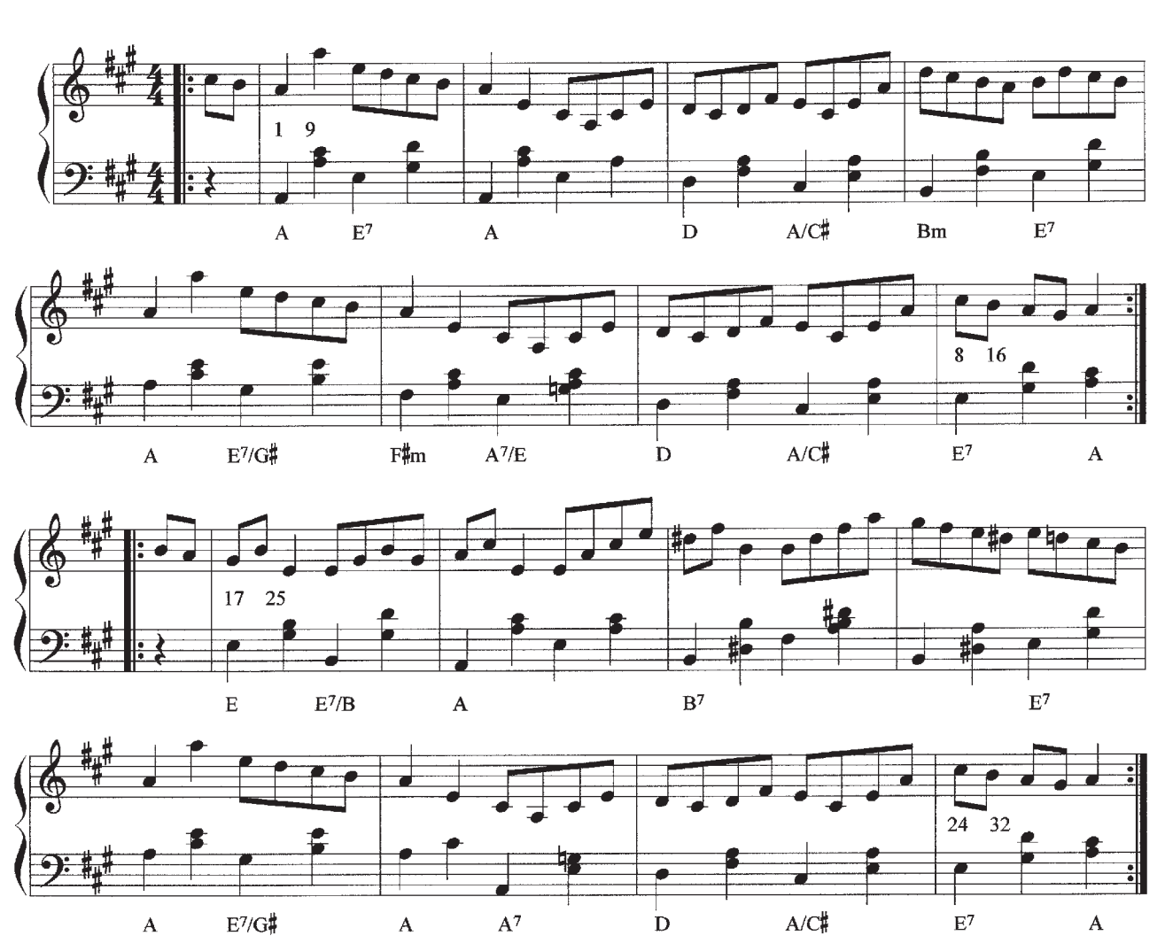
\label{lem:convergence} \mbox{Copyright Chinkscale Stebelin Recording Music Co.}