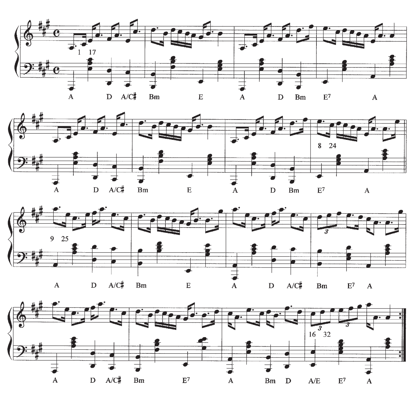
Figures Bars 33 - 40